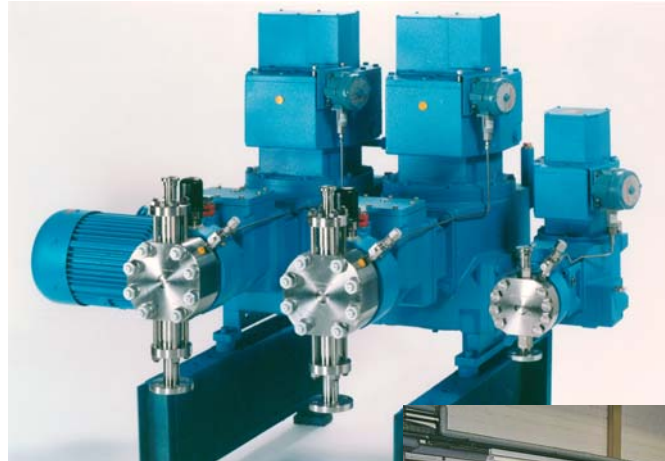
LEWA diaphragm metering pumps in 3-head design with stroke adjustment (electrically or pneumatically) for remote control and motors with frequency inverter