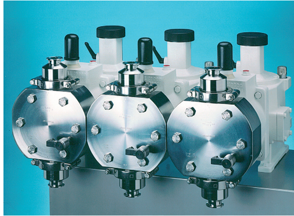
LEWA triplex hygienic diaphragm pump for feeding a spray dryer