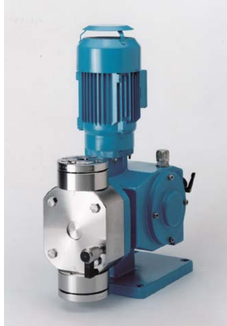
Fig.: LEWA ecodos type 750S1. 316TiSS (1.4571) and PTFE wetted materials offer excellent corrosion resistance.

As the world's population grows, so does the industrial food market. It is not surprising that the demand for food oils is increasing worldwide. Today approximately 40 different plants are used in the production of food oils. Depending on the region various seeds and fruits are processed including soy, rape seed, sunflower, peanut, coconut, palm kernels, linseed, etc.