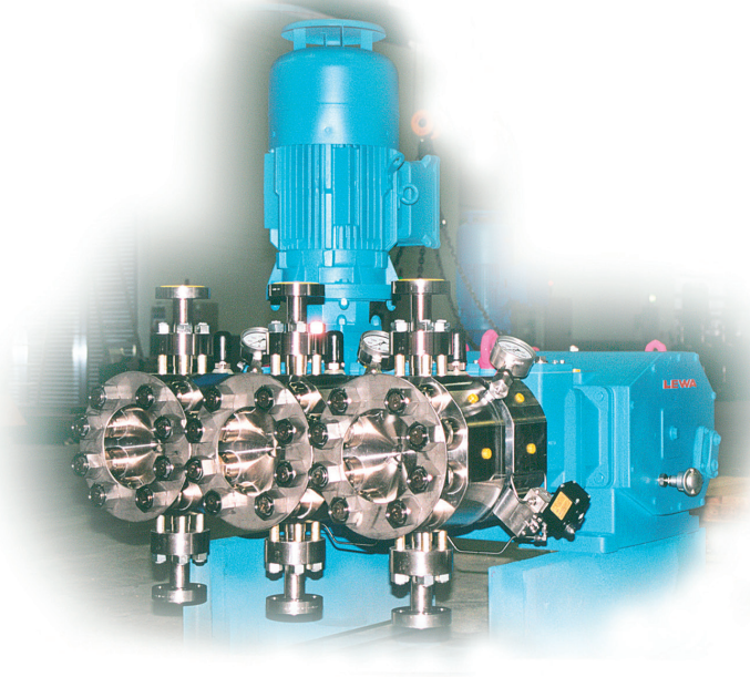
Fig. 1: LEWA process diaphragm pump for the conveyance of raney-nickel

Toluylene diamine (TDA) as preliminary product and diaminotoluol (MDI) as well as toluene diisocyanate (TDI) as intermediate products play an important role for the production of polyurethane (PUR).